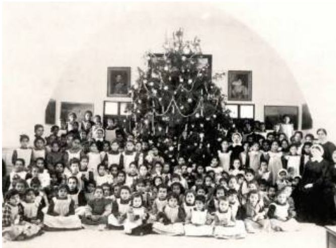
Pupils at Talitha Kumi School, Christmas 1900