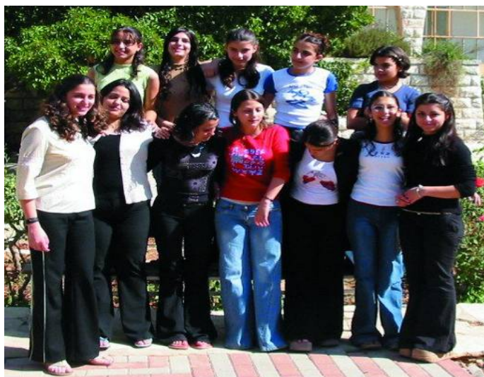
Top: The school Choir performing at the annual Christmas concert.